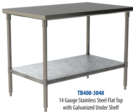
TB400-3048 14 Gauge Stainless Steel Flat Top with Galvanized Under Shelf