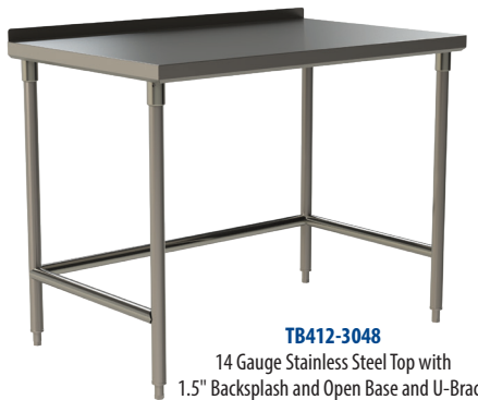
TB412-3048 14 Gauge Stainless Steel Top with 1.5" Backsplash and Open Base and U-Brace