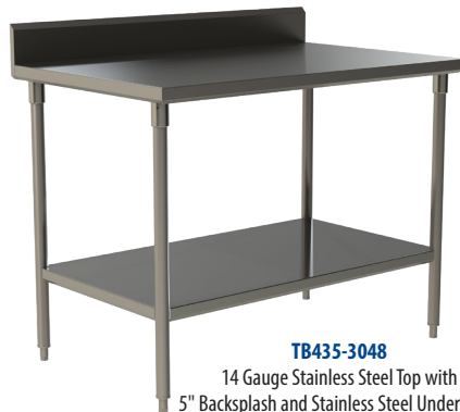
TB435-3048 14 Gauge Stainless Steel Top with 5" Backsplash and Stainless Steel Under Shelf